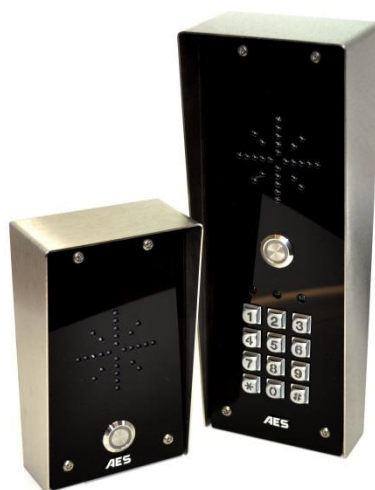
Traditional Hooded range