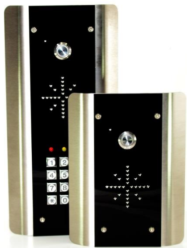
Curved Architectural range