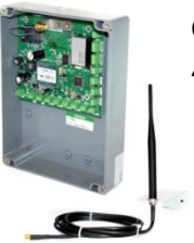
GSM-800-AB4 4 button model