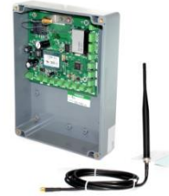
GSM-800-ABK2 2 button + keypad