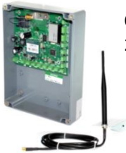
GSM-800-AB2 2 button model