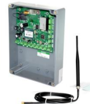
GSM-800-ABK6 6 button + keypad