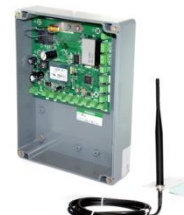
GSM-800-ABK8 8 button + keypad