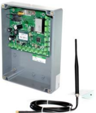
GSM-800-AB6 6 button model